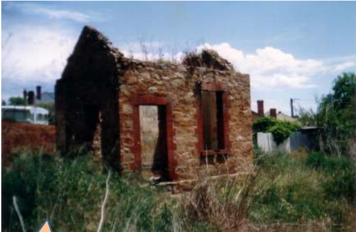
Ellis Cottage 1992