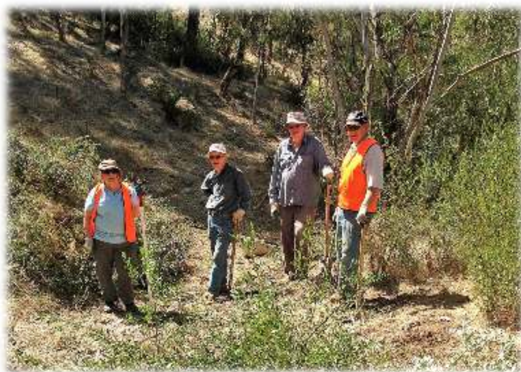
Members of the mid-week working group preparing for a DEWNR olive burn near Boehm Walk in 2015