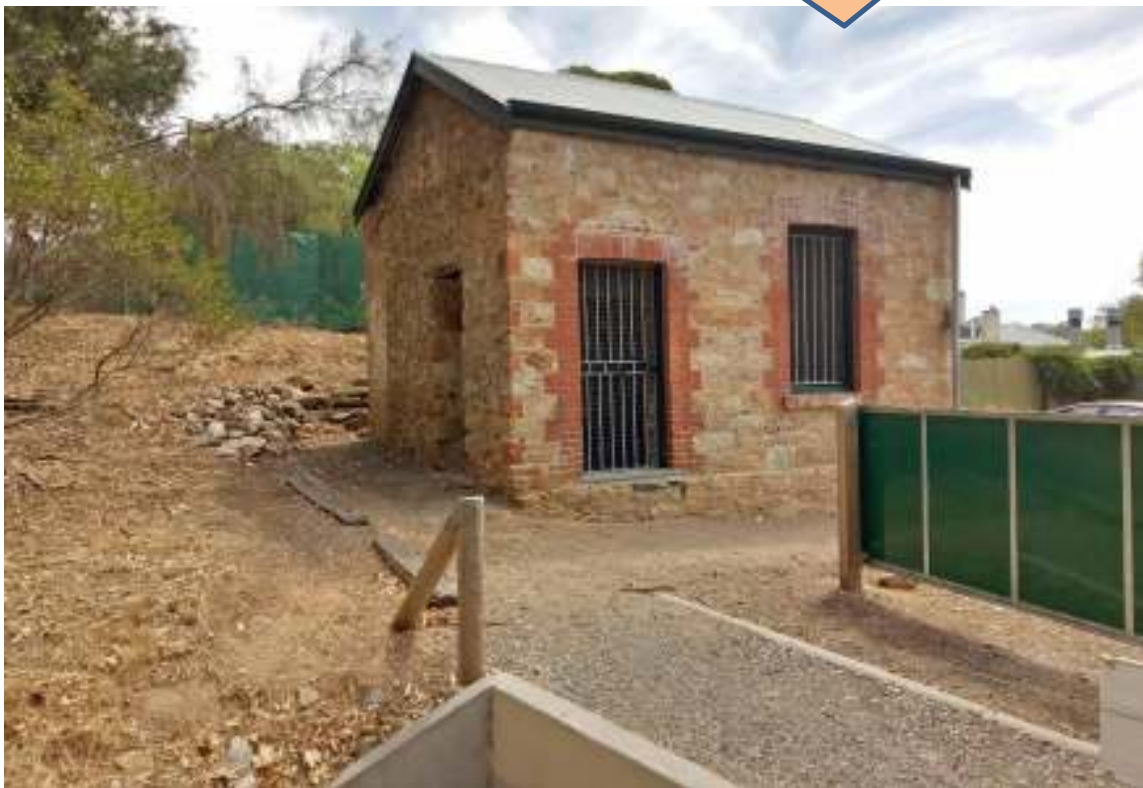
Ellis Cottage 2018